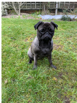
Coco from College Street