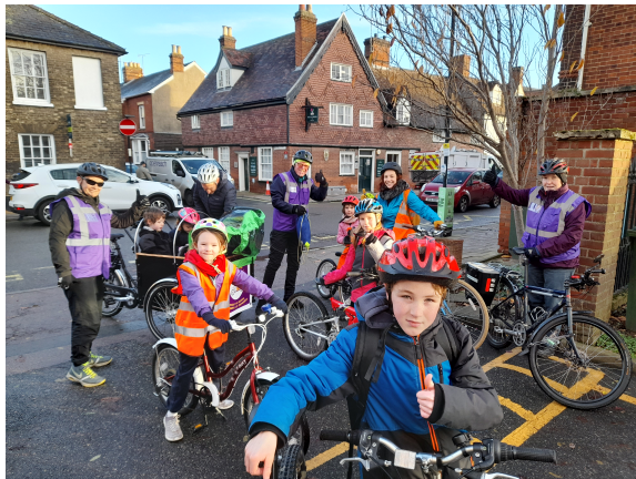
Homeward bound: The bike train gets ready to depart from St Edmund's Primary School

Trains run to a timetable along these routes, with families joining by bicycle along the way. WhatsApp's location-sharing function enables parents to see where the Train is (and whether they have missed it!). The routes have been chosen to make the most of cycling infrastructure where possible, and to minimise travelling on the busiest roads.