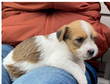
Frida, coming soon to Guildhall Street