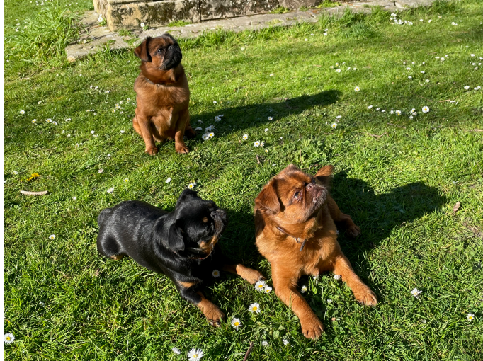
Nyra, Jack (back) and Coco from College St