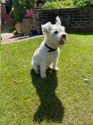
Axl from Crankles Corner