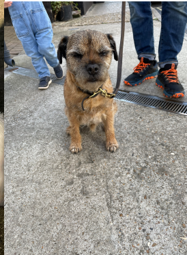
Boots from Whiting St.