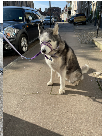
Ishta from Westgate St