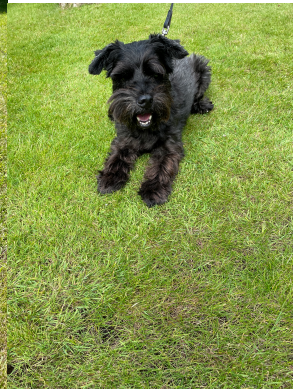
Bertie from Guildhall St