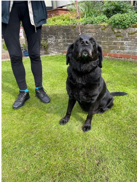
Cassie from College St